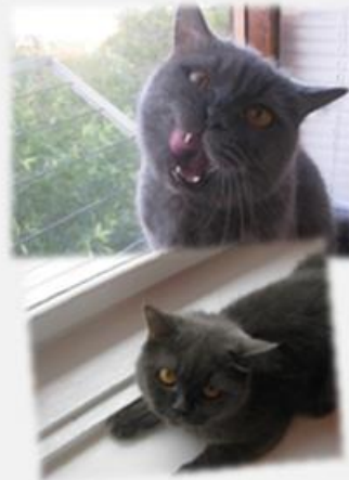
my first pet